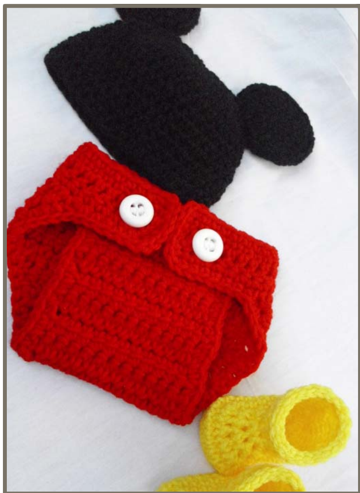
Made into Mickey Mouse pants © 2014

“A very cute way to cover a diapered bottom for any special occasion”