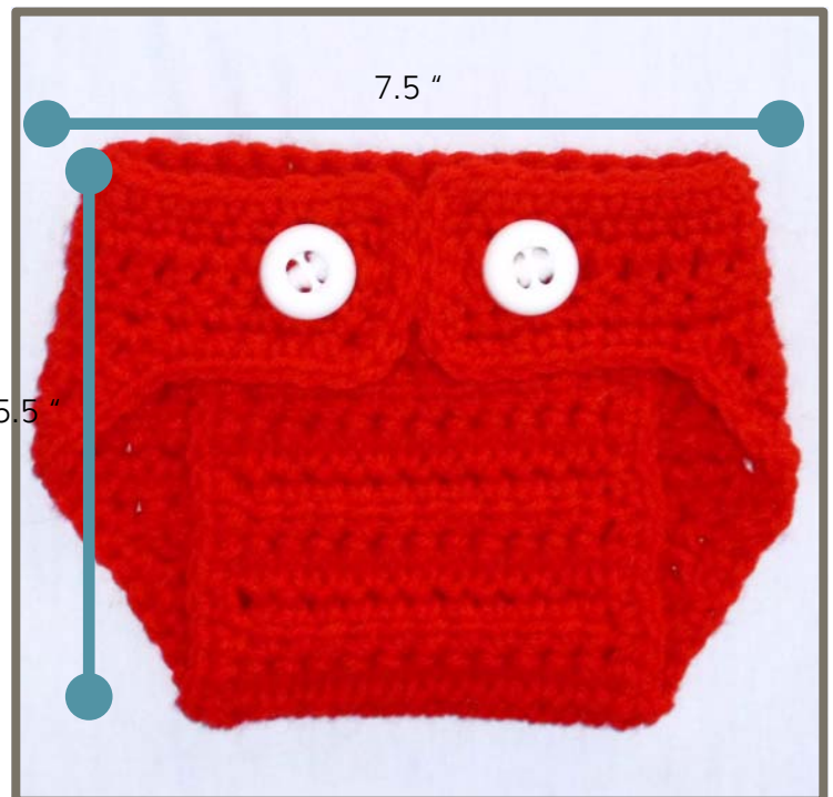
Folded Dimensions © 2014